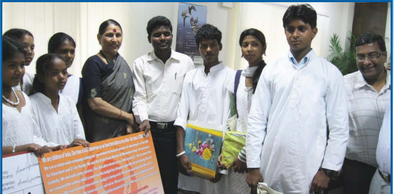
Child researchers submitting their demands and a copy of study to Smt. Krishna Tirath, Minister of Women and Child Development, Government of India at her office

In a joint initiative of Wada Na Todo Abhiyan( Keep your promises campaign), World Vision India, Peoples Action for Rural Awakening and National Coalition for Education(NCE), twenty thousand children conducted a research study of primary schools and Anganwadis in 16 states of the country. This score card portrays a real picture of government's preparedness on implementation of RTE Act. The survey looked at the infrastructure of 3677 schools and 3810 Anganwadis spread over 16 states in 57 Parliamentary constituencies, 120 assembly constituencies over 1000 villages.